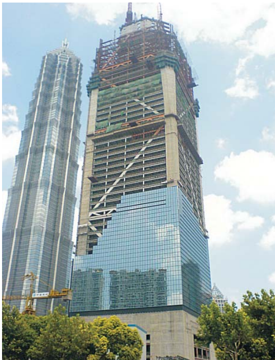
Any glass surface contamination is easily removed, reducing costs and lengthy delays

Glass destruction during construction is a contractors' nightmare and refers to the damage caused by concrete splatter, cement dust, moisture attack and cleaning materials. Alone, or in combination, these substances will damage the surface, often resulting in the need to replace the glass completely - leading to construction delays and costly financial penalties.