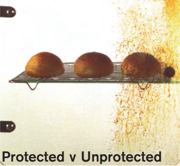
Glass oven door

ClearShield Food & Hygiene protects glass and ceramic surfaces to make them easy-clean and stain-resistant:-